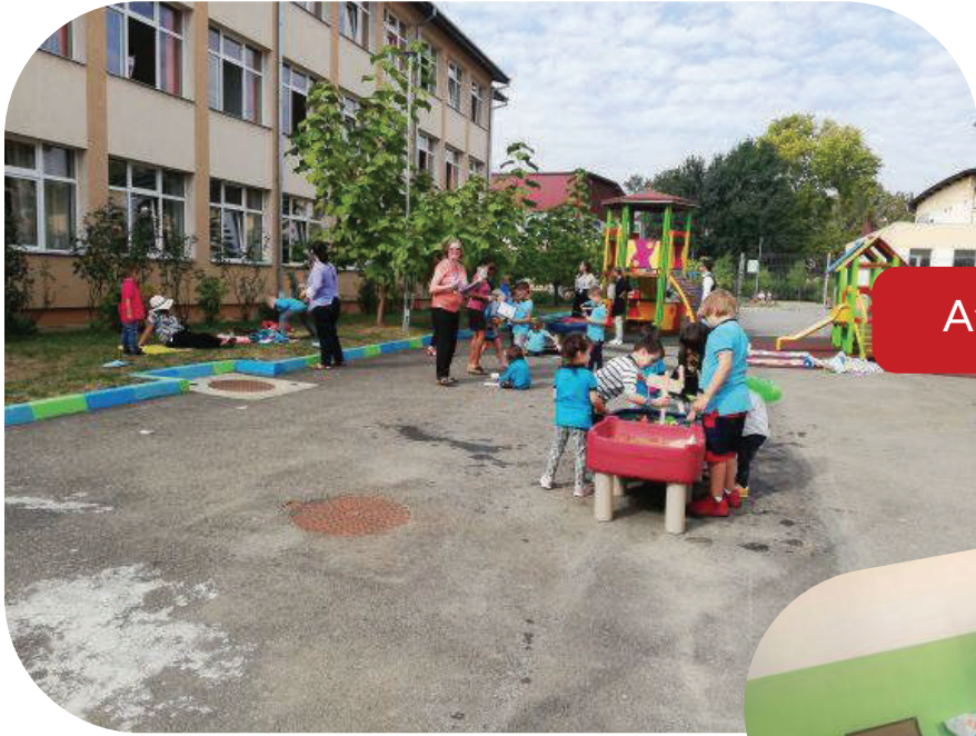
At the beach