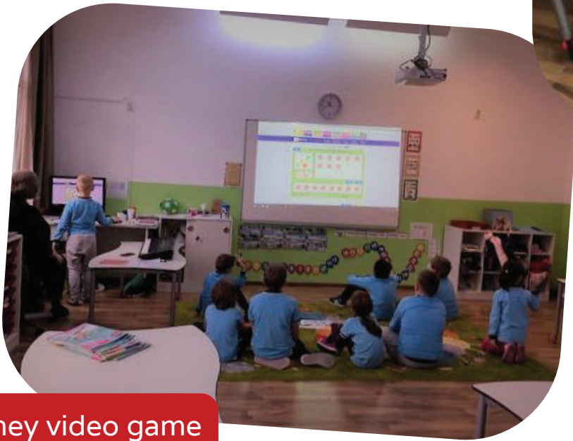
Money video game