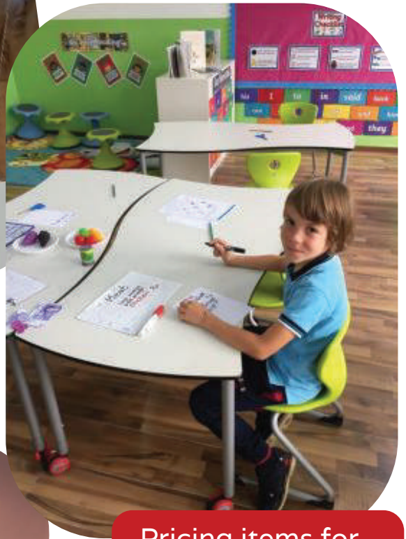
Pricing items for our shop