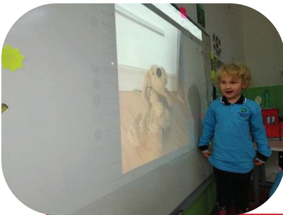
Presenting our homework